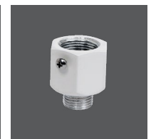
ADAPHUB (7) 3/4 NPS Hub adapter