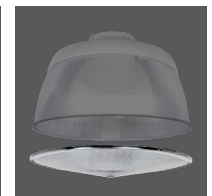
CDL Clear Lens Cover