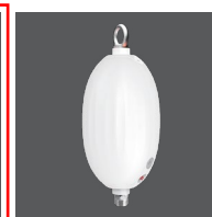
EBP-RM40R (6) Field installed Remote EM