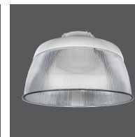
CLR Clear Reflector