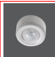
SENSOR (6) Plug in sensor