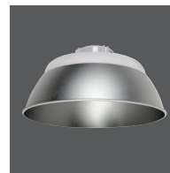
ALR Aluminum Reflector

Notes: (2) Installs directly to fixture only. (3) Fits onto clear PC reflector only. Do not attach directly to the fixture. (4) Rigid mount not for use in gymnasiums. (5) The Safety Cable accessory shall be utilized only as a secondary safety and not the primary means of mounting. (6) To meet state and local codes, EBP cannot be used with UHBS with sensor or with UHBS sensor accessory. (7) Also available in black finish.